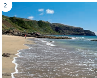
2 Praia Formosa (Santa Maria)

See, touch and learn the secrets of this volcanic archipelago on a fun and entertaining day trip around the island. A unique insight into how these diverse landscapes were formed.