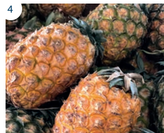
4 Pineapples (São Miguel)

The window frames and borders of traditional houses on Santa Maria adopt a colour associated with their specific village. Blues, yellows, greens and reds are used.