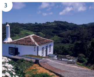
3 Colourful Houses (Santa Maria)

Although not a traditional beach destination, this is one of the best beaches of the Azores (Blue Flag status) and one of the few white sand beaches in the archipelago.