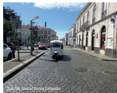
Tuk Tuk tour of Ponta Delgada

Day Eight: Transfer to Ponta Delgada airport for your return flight to the UK.