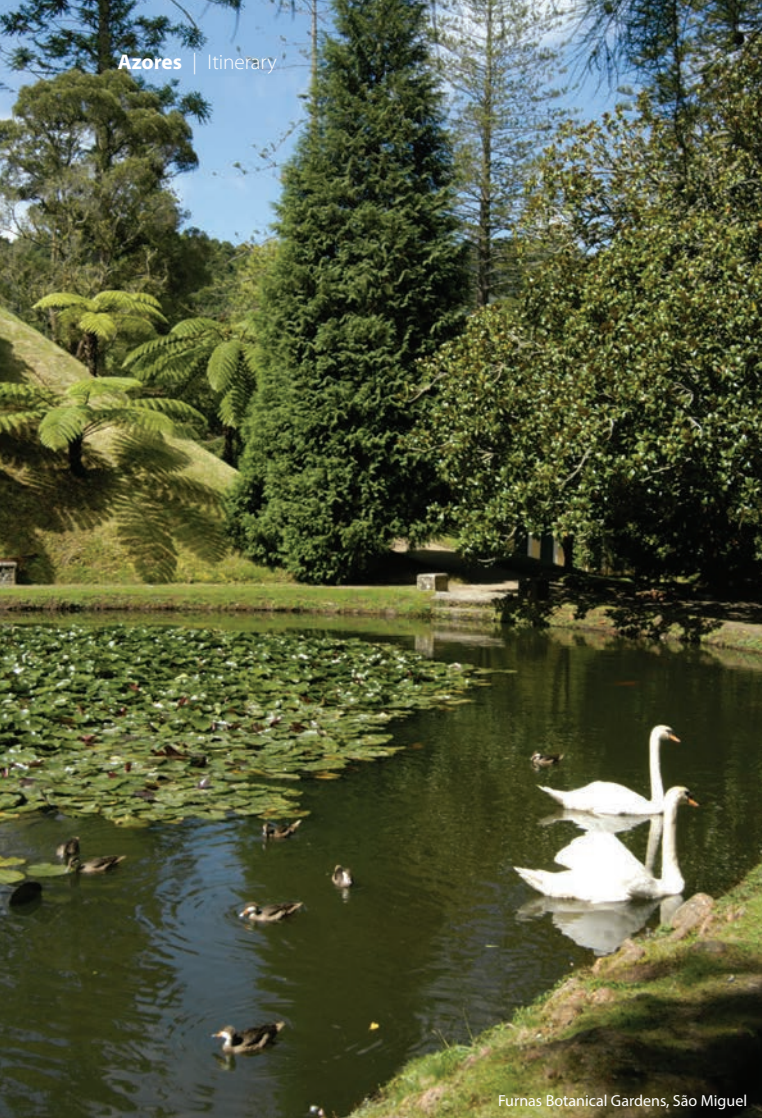
Furnas Botanical Gardens, São Miguel