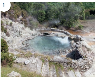
1 Geological History Tour (São Miguel)

The fabulous spa town of Furnas, on São Miguel, is one of the largest thermal water sources in the world, with its beautiful azalea bordered lake and 30 acre botanical garden. Everywhere, from April to early summer, hedgerows of azaleas and hydrangeas can be seen across the islands.